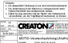
Drawing MOTIO Veranschaulichung-Alu-Holz