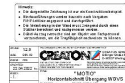
Drawing MOTIO Horizontalschnitt-Uebergang-WDVS