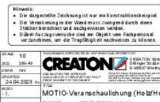
Drawing MOTIO Veranschaulichung-Holz-Holz